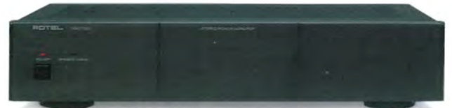
RB970BX stereo power amplifier