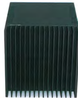
RMB100 monoblock power amplifier

Whether building your home theater from scratch or adding to an existing system, this amplifier is the answer. With five channels each delivering 100 watts, the RB985 puts plenty of power in a highly efficient and convenient package. ■ The THX-approved RB985 exemplifies Rotel's commitment to home theater performance. A massive 1500VA toroid transformer combines with oversized, high capacity filter capacitors and precision regulators to provide extraordinary smooth operating voltages. Each of the RB985's 20 output devices is rated for 130 watts and 15 amperes of current. This high voltage, high current design assures uncompressed and dynamic reproduction of today's music and video sources. ■ The RB985 makes connecting your home theater system easy and convenient. A multi-pin connector, allowing single-cable hook-up, complements an array of gold-plated RCA jacks. Rugged, heavy duty binding posts accept a variety of audiophile-grade speaker cables.