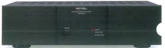
RB980BX stereo power amplifier