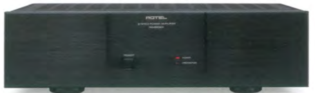
RB990BX stereo power amplifier