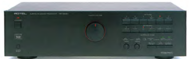
RSP980 THX surround processor