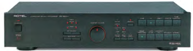
RSP960AX Dolby surround processor

We are ready for the future with the RDA980 Dolby AC-3 Digital Surround sound adaptor. This outboard processor can be easily connected to the RSP980/RTC970 to decode all 5.1 channel digital signals from laser discs that are Dolby AC-3 encoded. The future is digital and Rotel is ready.