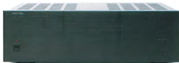
RB985 five-channel power amplifier

"...its main calling card is flexibility, which means that it's ready to serve today and won't become obsolete tomorrow." Mark Horowitz, Sound and Image, Summer 1994