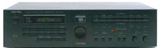
RTC970 surround tuner /pre-amp