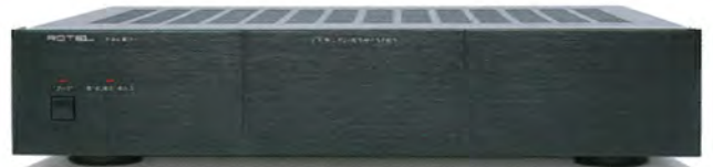
RB930AX stereo power amplifier

Designed to switch up to 15 amps of current at 120V/60Hz. 9 outlets – 8 switched, 1 unswitched.